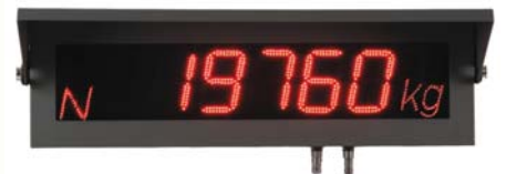
Shown with optional remote display