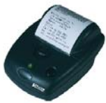
Shown with optional printer