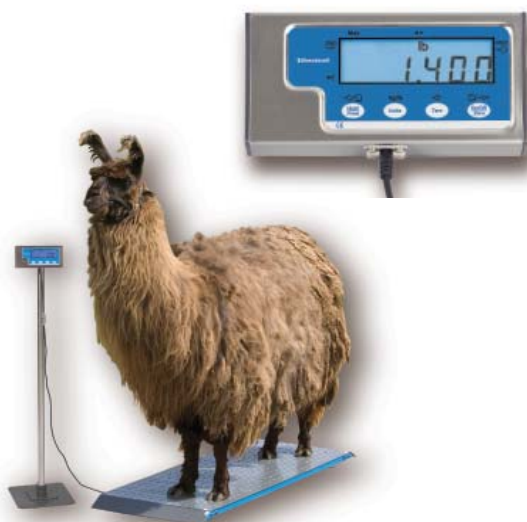
PS1000 shown with optional indicator stand