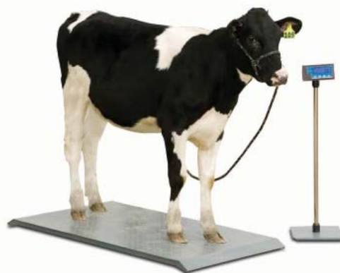
PS2000 shown with optional indicator stand